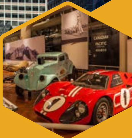
Henry Ford Museum of American Innovation