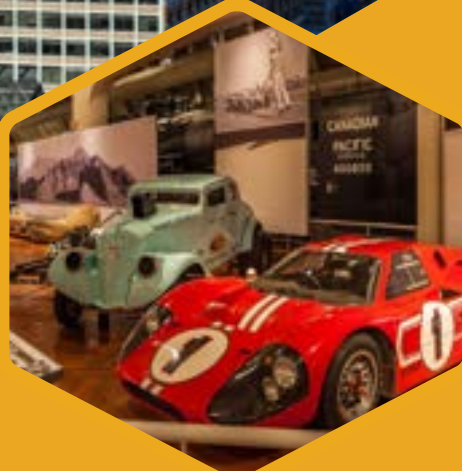
Henry Ford Museum of American Innovation